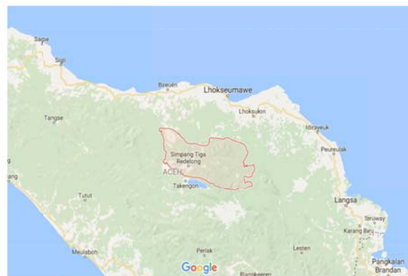
Bener Meriah Region