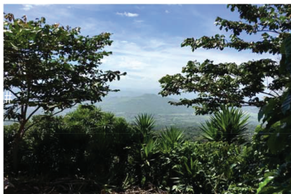
View from Finca Sabanetas