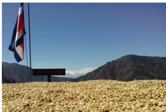
Parchment drying in Tarrazu